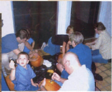
Pumpkin Carving Contest